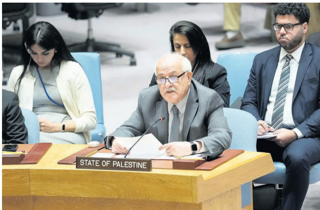
Riyad Mansour, Palestinian Ambassador to the United Nations, speaks during a Security Council meeting at United Nations headquarters, Tuesday, Feb. 20, 2024.

Gaza Health Ministry which says the vast majority were women and children. It was the third U.S. veto of a Security Council resolution demanding a cease-fire in Gaza and came a day after the United States circulated a rival resolution that would support a temporary cease-fire in Gaza linked to the release of all hostages and call for the lifting of all restrictions on the delivery of humanitarian aid. Virtually every council member — including the United States — expressed serious concern at the impending catastrophe in Gaza's southern city of Rafah, where some 1.5 million Palestinians have sought refuge, if Israeli Prime Minister Benjamin Netanyahu goes ahead with his plan to evacuate civilians from the city and move Israel's military offensive to the area bordering Egypt, where Is-